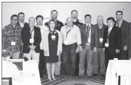
ASD Board of Directors.