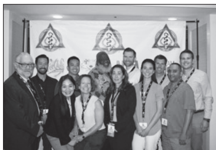
ASD New Members