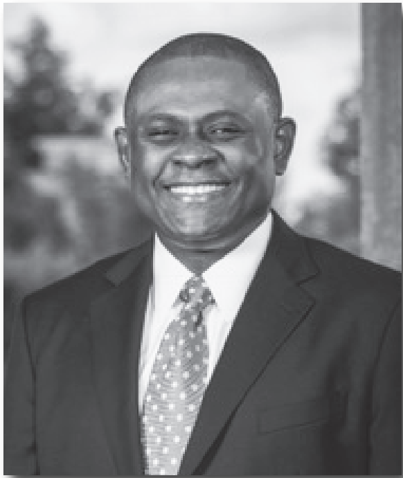
2017 HONORARY MEMBER Dr. Bennet Omalu